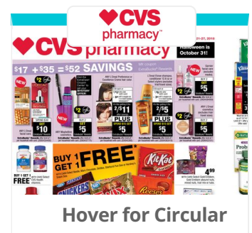
Hover for Circular