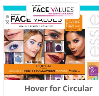
Hover for Circular