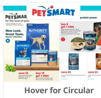
Hover for Circular