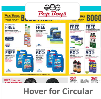
Hover for Circular